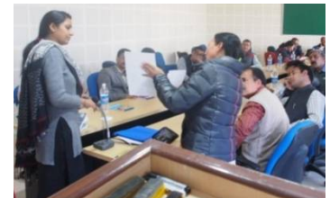
Learning in progress